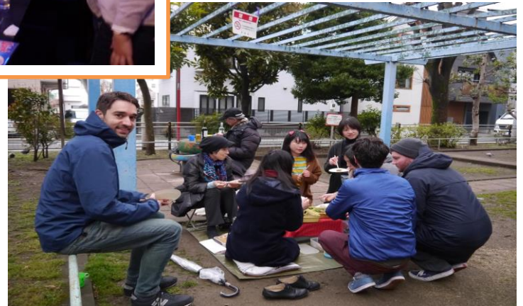
Cherry blossom view