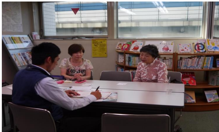
Interview5 Japan Okinawa