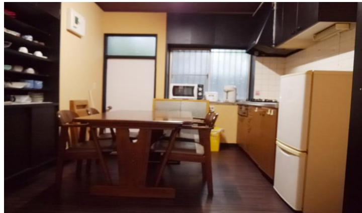
Dining • Kitchen