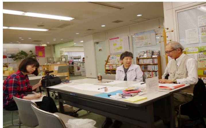
Interview6 Japan College Learning