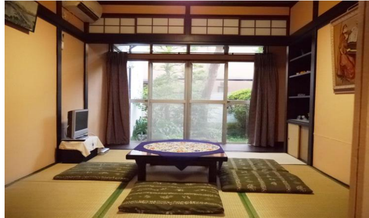
Japanese style room Living