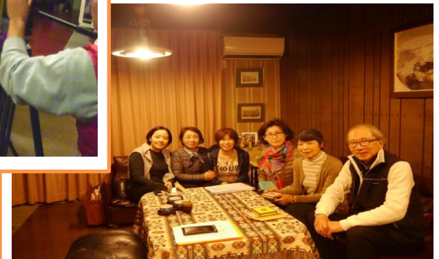
Interview 5 Korea