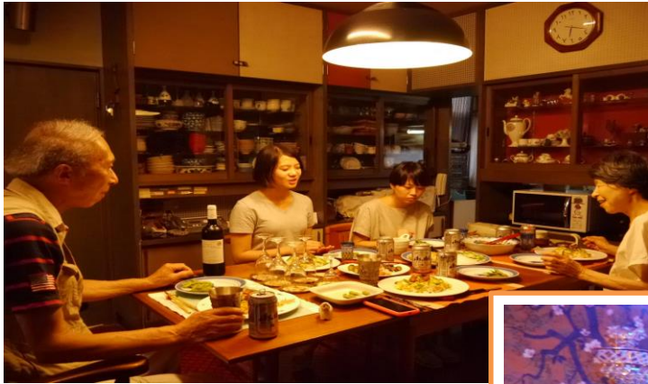
Welcome Party 1