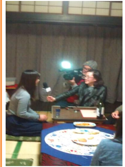
Interview 3 Japan