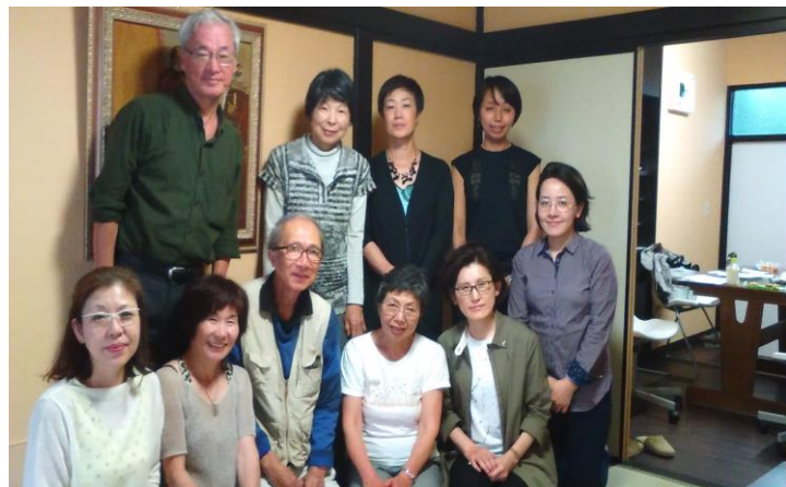
Home share Owner meeting