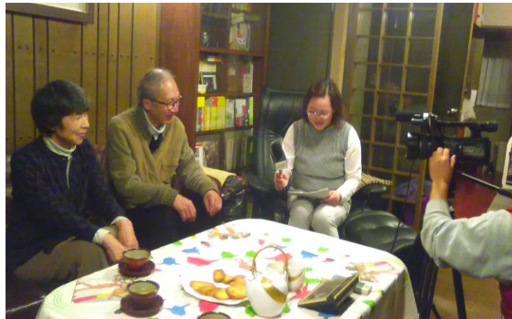
Interview 4 China