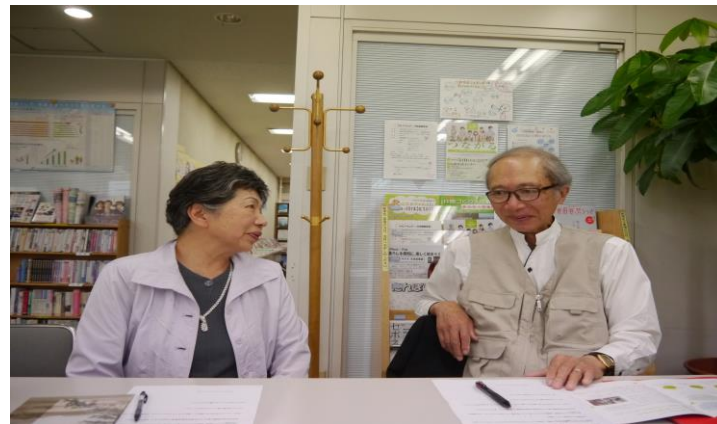
Home share Owner