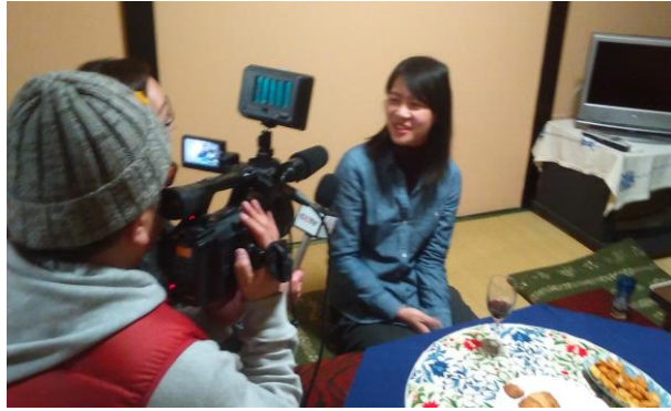
Interview 1 Japan